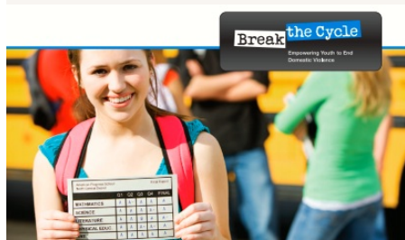
2010 State Law Report Cards A National Survey of Teen Dating Violence Laws

"To facilitate policy improvements and clarify future best practices, Break the Cycle began the State Law Report Card Project. The Report Cards focus on minors' access to Civil Protection Orders (CPOs) and identify five indicators for assessing each state's laws. "